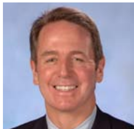
Events Page 9