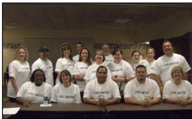
Volunteers from Allstate participated in United Way of Summit County's Day of Action.

Sixteen volunteers from Allstate Insurance Company in Hudson donated their time to assemble and deliver "Thinking of You" gift bags to people with MS living in long-term care facilities throughout Summit County. In addition, they helped to prepare a Bike MS mailing.