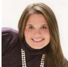
Programs Page 13