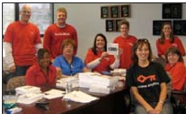
KeyBank volunteers made a difference by participating in Neighbor's Day.

Another group also helped with preparations for the August Bike MS event. Nine volunteers from KeyBank in Cleveland, who participated in Neighbor's Day, helped to assemble the rider numbers.