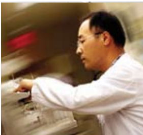
Research Page 6