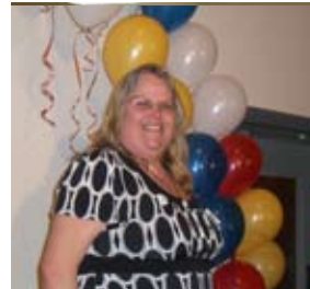
Volunteers Page 20